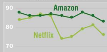
ACSI Trend: 2007-2015

Amazon sales up 22% for holiday 2015*; U.S. subscriber growth slows for Netflix